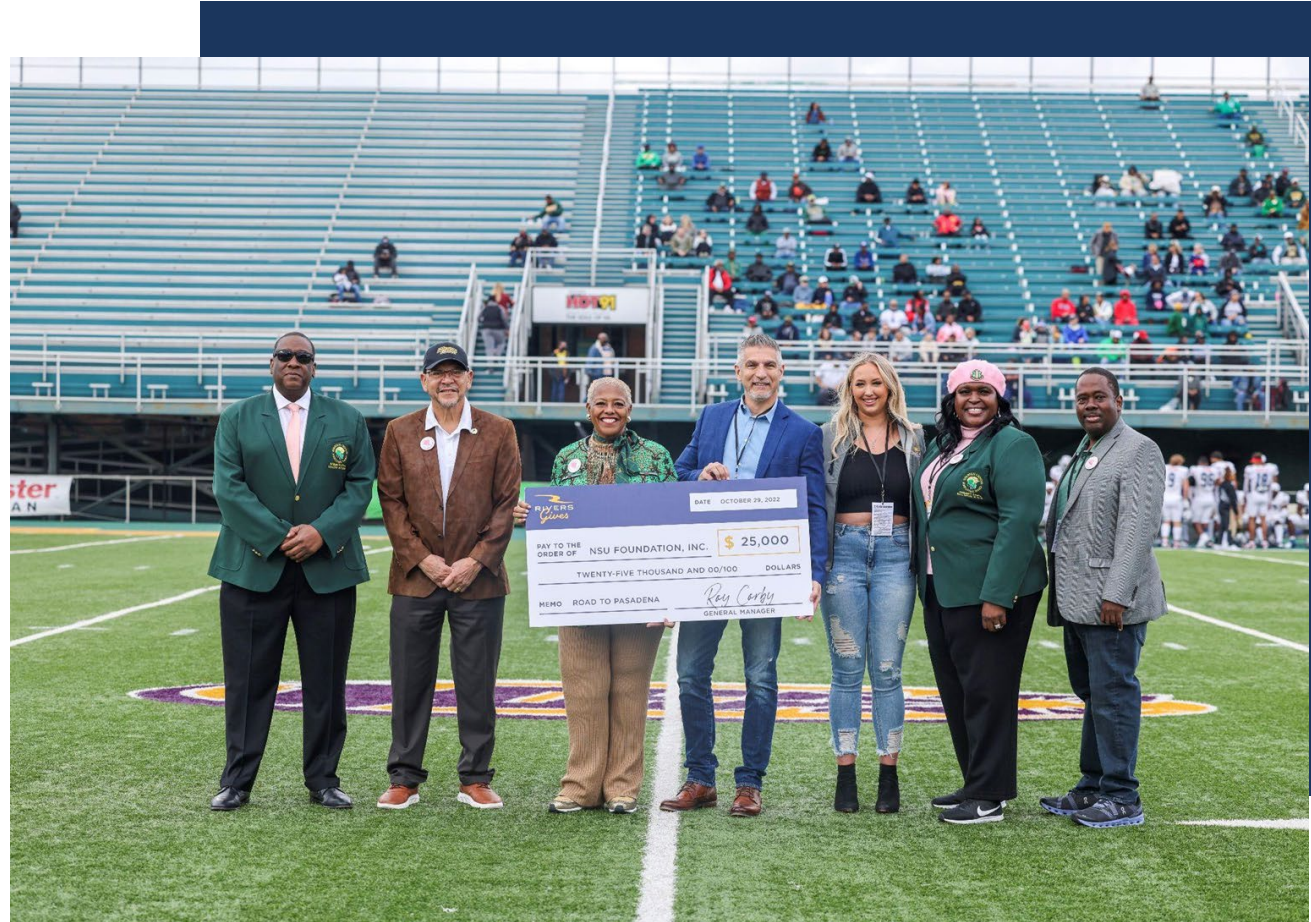
Rivers Casino Portsmouth presents check to Norfolk State University for 2023 Rose Parade student travel expenses.