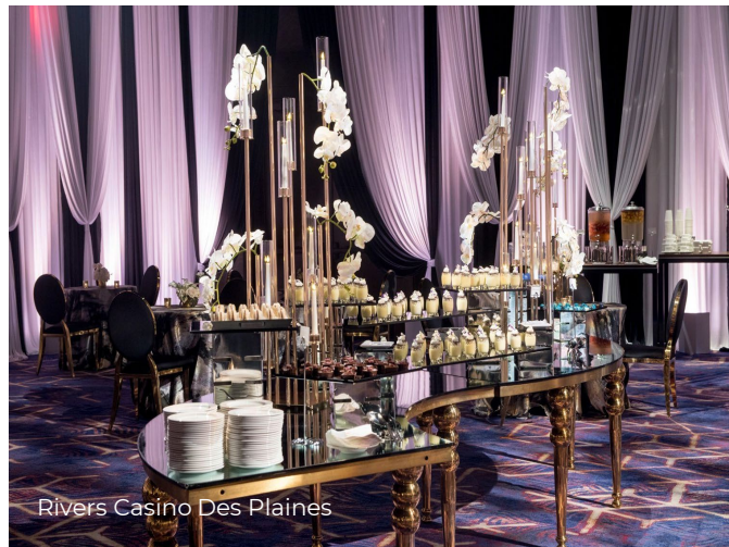
Rivers Casino Des Plaines