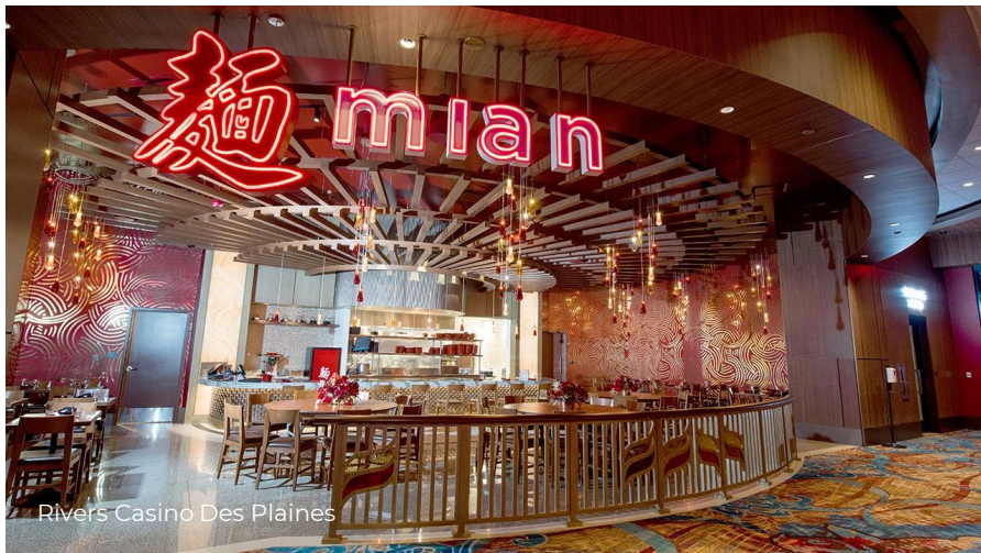
Rivers Casino Des Plaines