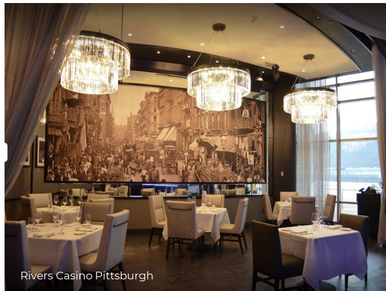
Rivers Casino Pittsburgh