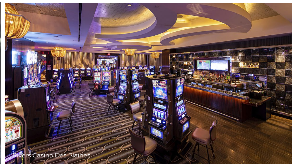
Rivers Casino Des Plaines