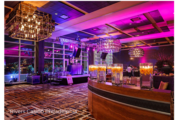
Rivers Casino Philadelphia