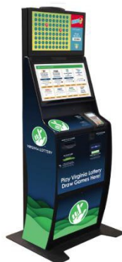
Game Touch Draw Machine