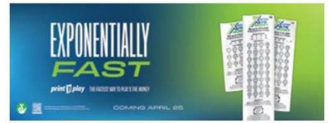
Writing Surface Insert