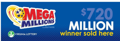
Mega Millions Winner Awareness