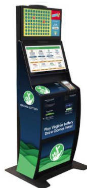
Game Touch Draw Machine