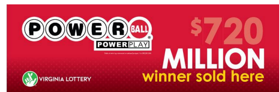
Powerball Winner Awareness