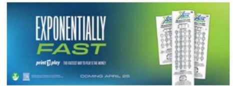
Writing Surface Insert