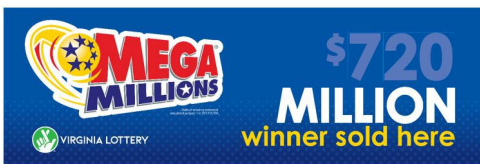
Mega Millions Winner Awareness