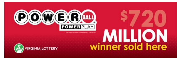
Powerball Winner Awareness