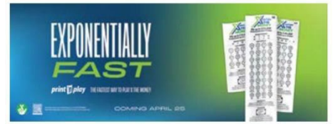
Writing Surface Insert