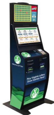
Game Touch Draw Machine