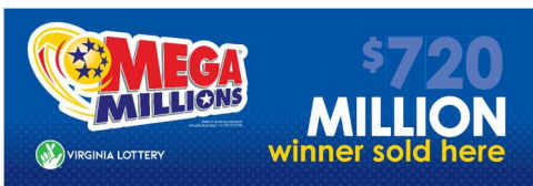
Mega Millions Winner Awareness