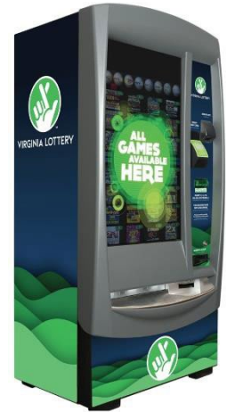
Lottery Vending Machine (28)