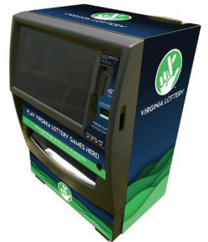
Lottery Vending Machine (20)